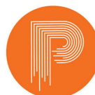
Paris College of Art